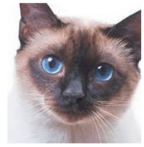
Tell us how we did