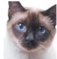
Tell us how we did

The goal of this site is to increase access to soft skills training by creating a centralized repository of tasks/curricula. On the main page, the Tell us how we did icon offers you the opportunity to provide feedback on this resource via a short, 6-question survey.